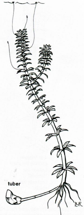
Hydrilla verticillata . Aquatic plant line drawing is the copyright property of the University of Florida Center for Aquatic Plants (Gainesville). Used with permission.

Remember that a Michigan law was recently enacted that states: "A person shall not place a boat, boating equipment, or boat trailer in the waters of this state if the boat, boating equipment, or boat trailer has an aquatic plant attached."